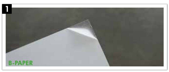
Peel off a corner of the white backing paper from the B-Paper and fold it over.

The B-Paper has a matt and glossy side. The matt side is the backing paper and it will be disposed of after peeling it off from the foil.