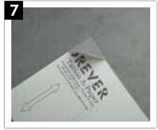
Use a squeegee, ruler or something similar and push the B-Paper backing paper away by rubbing over the B-Paper. Now the glue is applied and the tattoo paper is ready for transfer.