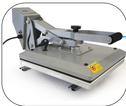
Pliers for opening/closing

The need to open the door is indicated by a beep. The appliance does not open automatically, it should be opened manually using the "pliers". When opening the heat press, it is advisable to hold down the lower leg of the appliance with one hand to prevent it from tipping over.